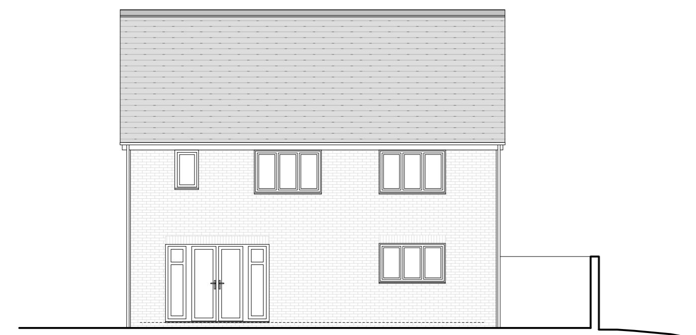
20.000m north elevation as existing