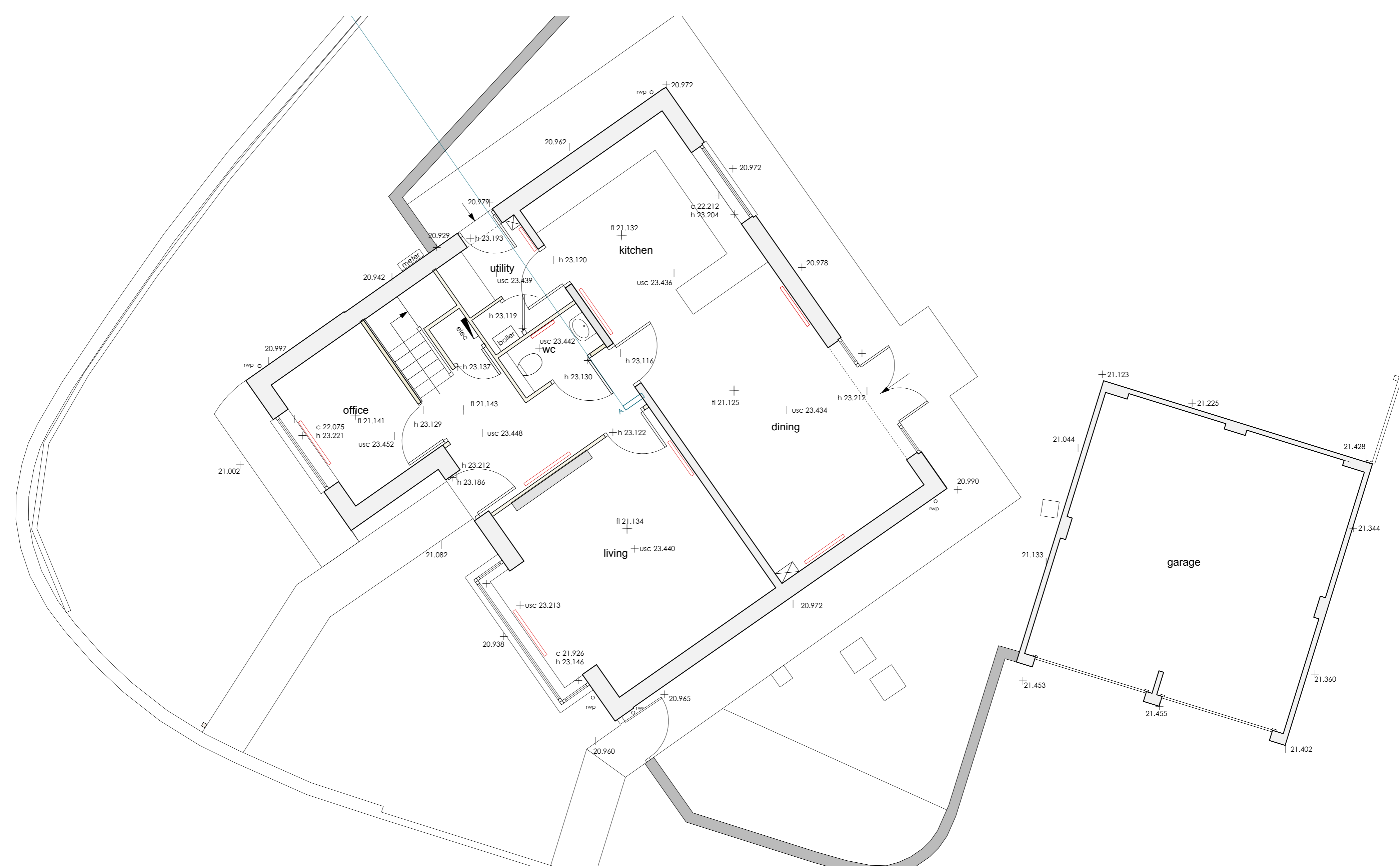
Existing Ground Floor Plan 1:50