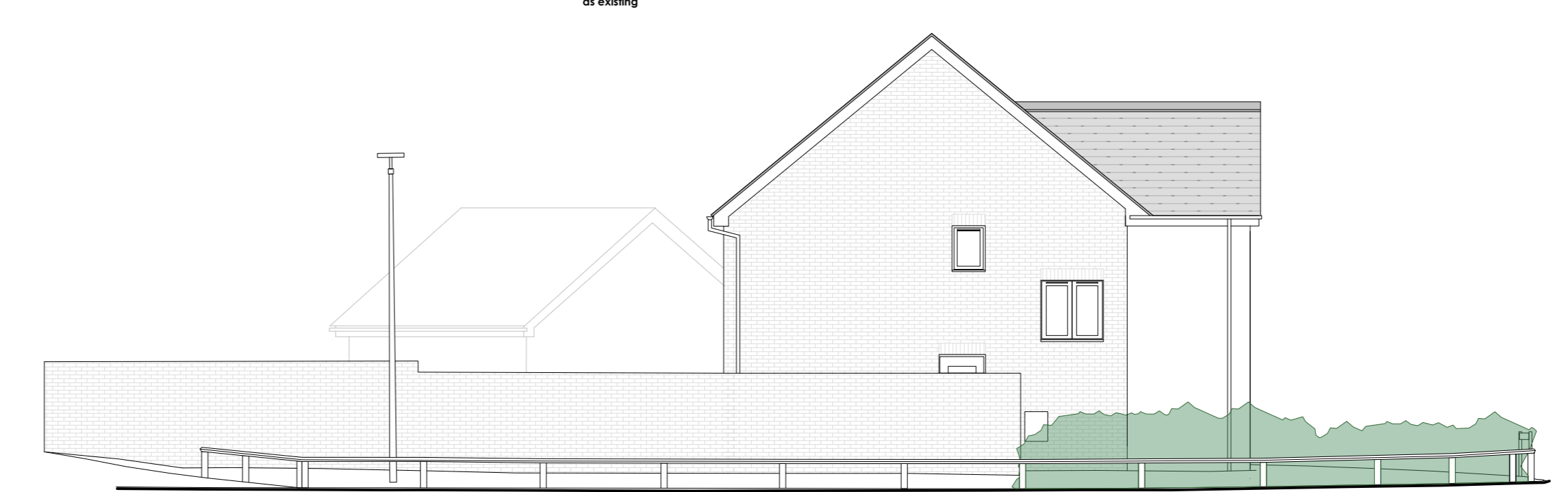
20.000m west street elevation as existing