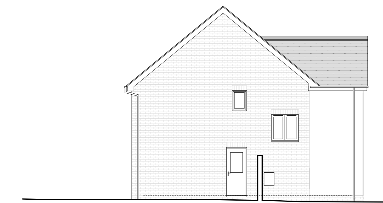
20.000m west elevation as existing