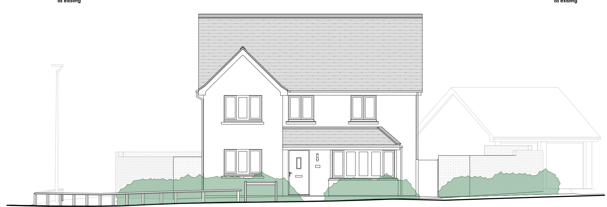
20.000m south street elevation as existing