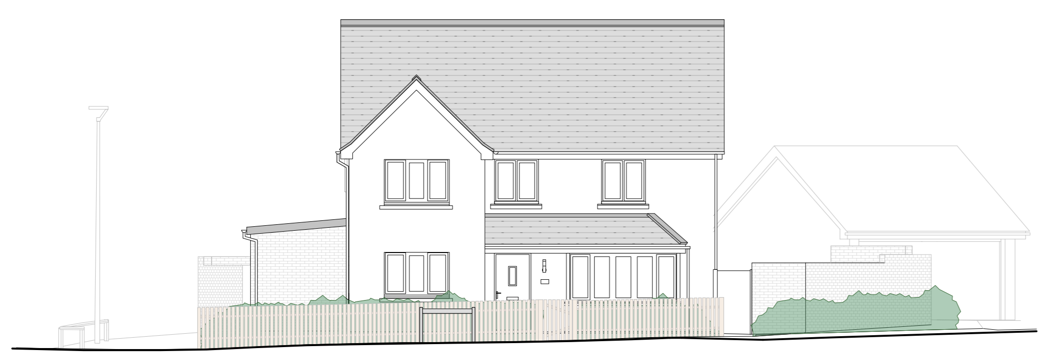
20.000m south street elevation as proposed