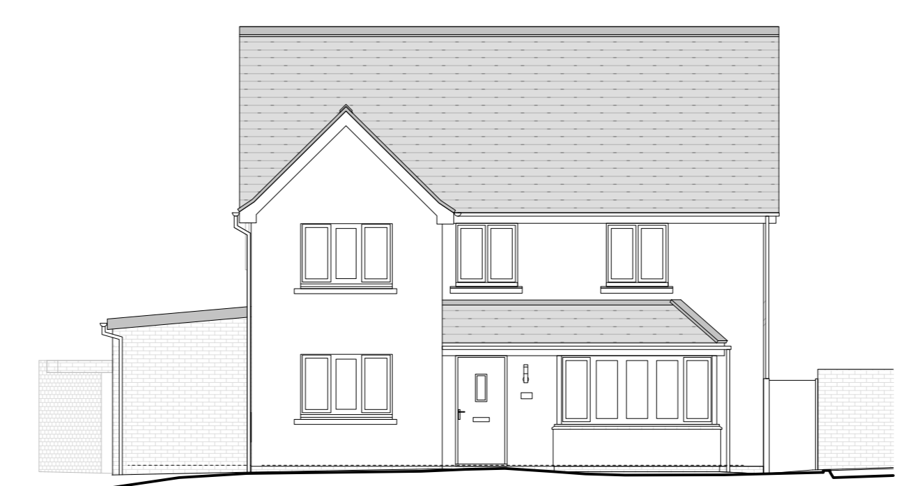
20.000m south elevation as proposed