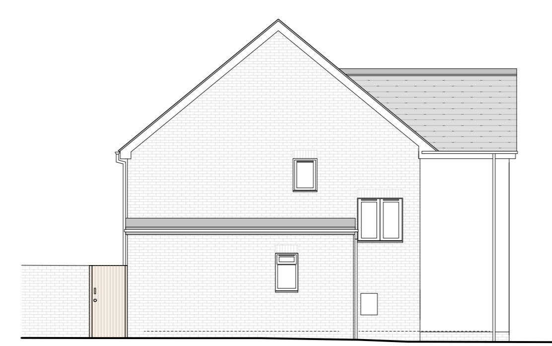
20.000m west elevation as proposed