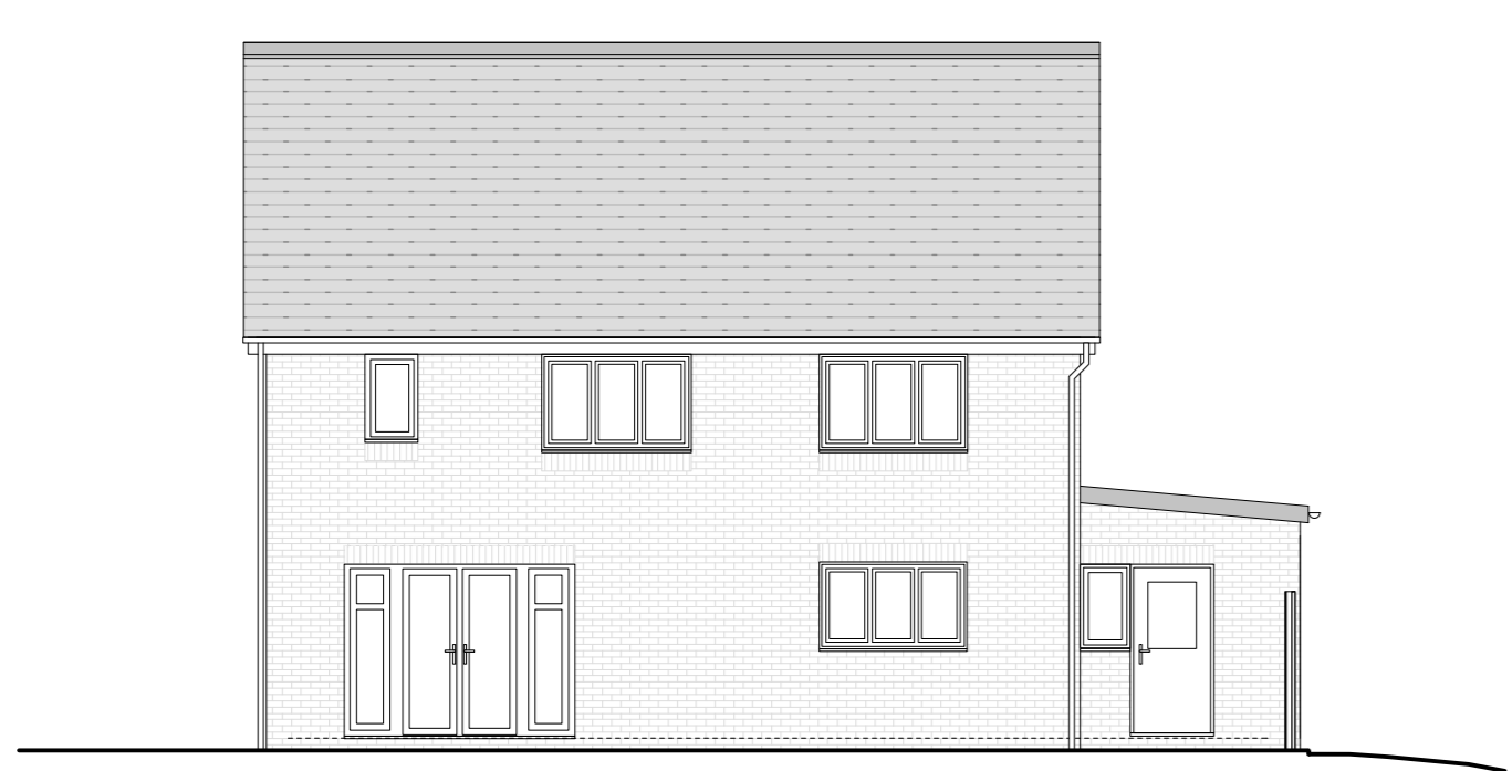
20.000m north elevation as proposed